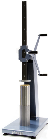
Cutting and extruding soil sampler with rack and pinion mechanism 16-T0026/A. Suitable for samples up to 100mm dia.